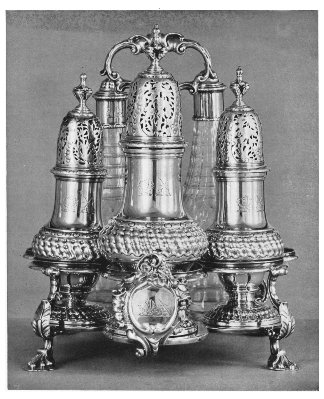
Cruet frame by Paul de Lamerie. 1750-51. (Lord Swaythling)