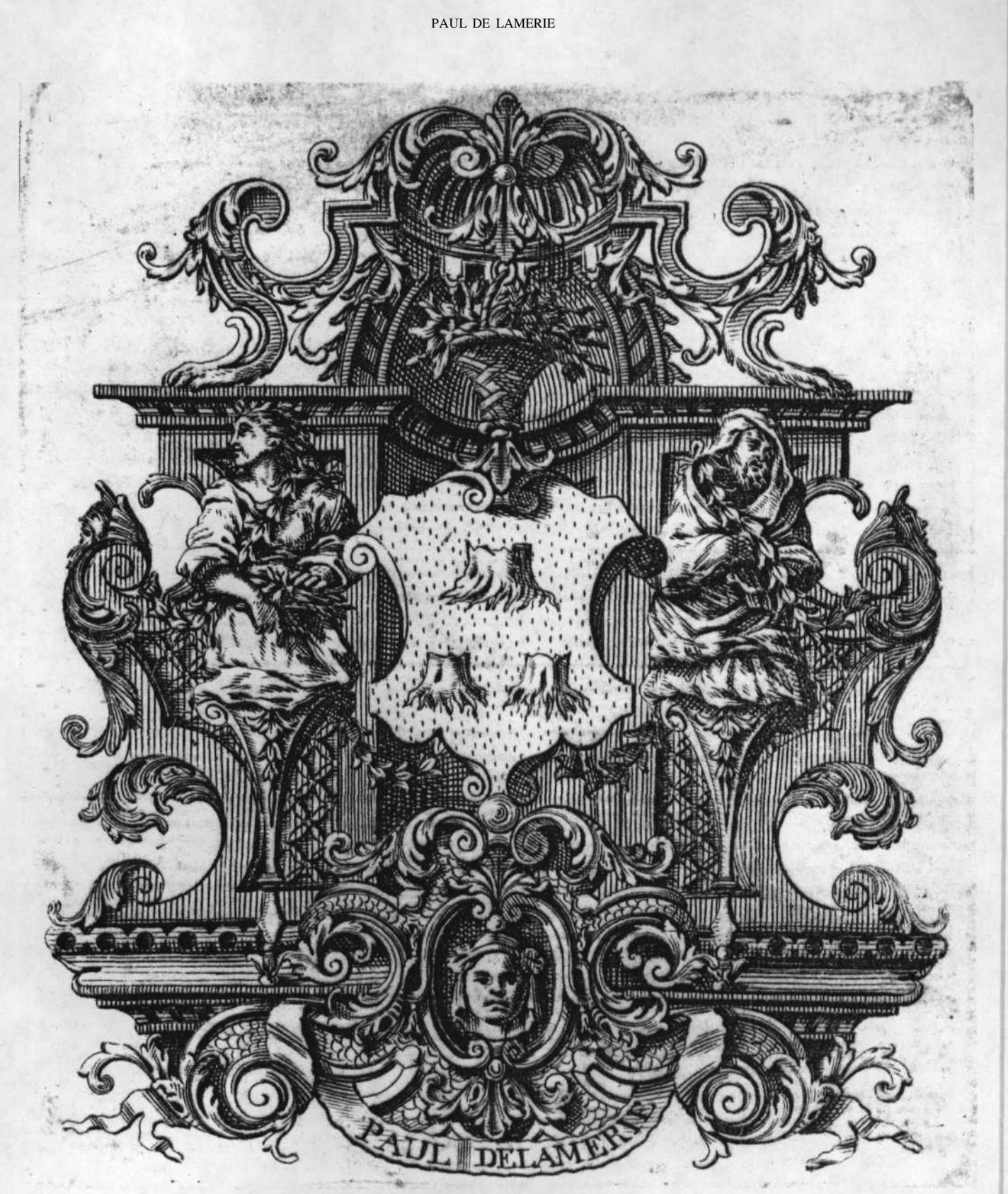
Fig. 3. Bookplate engraved by William Hogarth (Royal Library, Windsor Castle)

The fact he was by this time a man of considerable means is deduced from the considerable investments in property he began making from early in 1733, also from his lending money on mortgage. The first was a parcel of land in Piccadilly with 'the Messuages or Tenements, Erections and Buildings thereupon erected', and others followed in 1734,1739, 1741 and 1743, several in the Westminster area but also as far afield as Gloucestershire (cat no. 122).