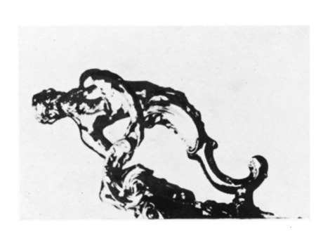
35. Handle of ewer, by Paul de Lamerie. Hall-marked 1741. (Goldsmiths' Hall, London.)